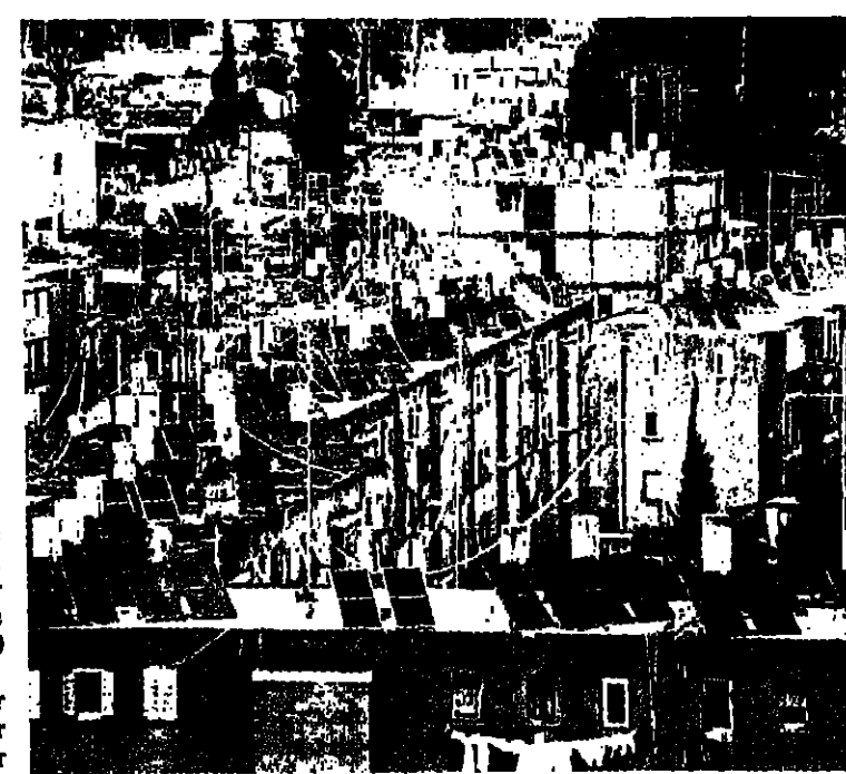
Roofscape of a Lod housing estate.

Sixty per cent of those with solar heaters use the 120 litre tank, 30 per cent the 150 litre tank, and the other 10 per cent larger ones ranging up to 200 litres.